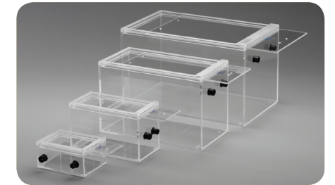
Small Animal Induction Chambers