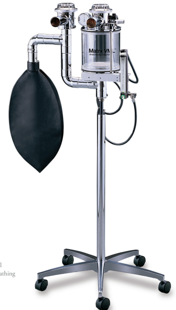
Matrx VML® Large Animal Anesthesia System Designed for use in equine, bovine and other large animal anesthesia, this machine features a 2" (5cm) diameter breathing circuit, 5200cc CO 2 absorber and 30 Liter breathing bag.