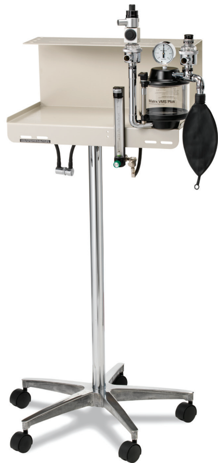
Matrix VMS® Plus