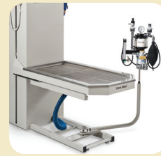
VMS® and Swing Arm Mount with Canis Major® Lift Table. Swing Arm Mount is also available for the VME®

Matrx™ anesthesia machines are carefully manufactured to provide you with years of safe, simple and controllable anesthesia delivery. With wall, stand, tabletop, and table-mounted configurations, we are sure to have the anesthesia delivery solution that fits your clinical needs.