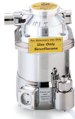
Sevoflurane VIP 3000®

The choice of veterinary professionals for accurate, controlled anesthesia delivery under all conditions.