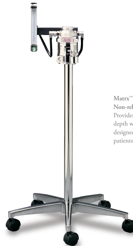
Matrx™ VMR Low-flow Non-rebreathing System Provides rapid control of anesthesia depth with little resistance to respiration; designed for small rodents, exotics and patients weighing less than five pounds.