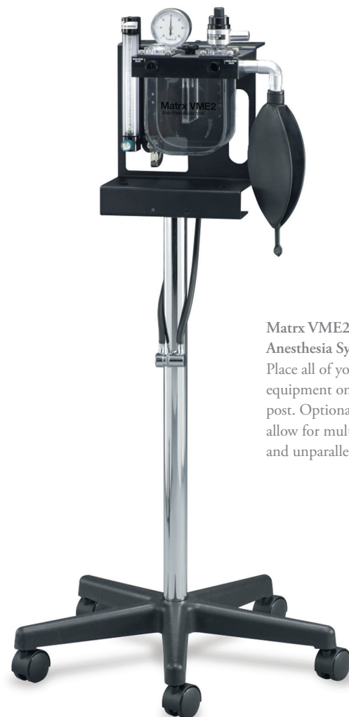
Matrx VME2® Small Animal Anesthesia System Place all of your anesthesia equipment on one sleek, compact post. Optional, add-on components allow for multiple configurations and unparalleled flexibility.