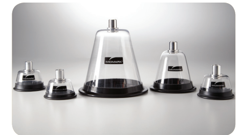
Small Animal Anesthesia Masks