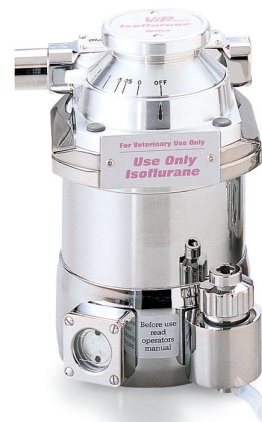
Isoflurane VIP 3000®