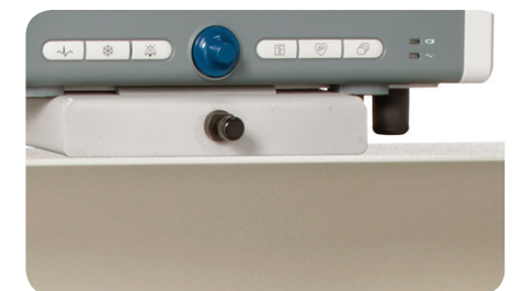
Cardell® Monitor Mount with VMS® Plus