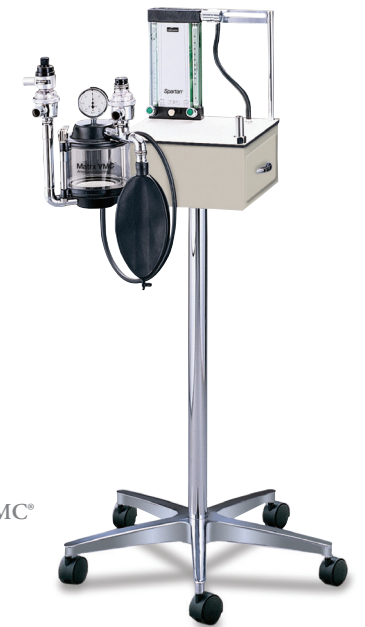
Matrix Spartan VMC®

Quick release lever 1500cc CO 2 absorber with quick release lever feature for easy absorbent replacement (accepts prepack canisters or 1350gm loose absorbent).